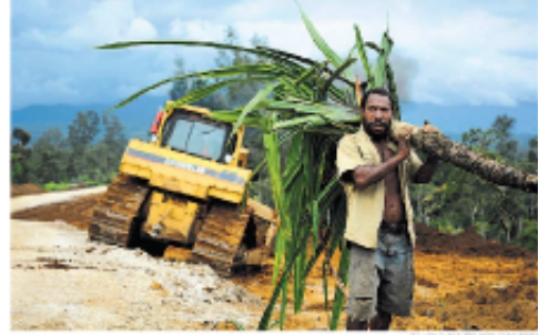
In Tari, Papua New Guinea, a man salvaged a tree that had been felled for road construction.

By NORIMITSU ONISHI TARI, Papua New Guinea — A booming myth in the Southern Highlands of Papua New Guinea is said to have heralded the arrival of ExxonMobil, the American oil giant that is preparing to extract natural gas here and ship it overseas.